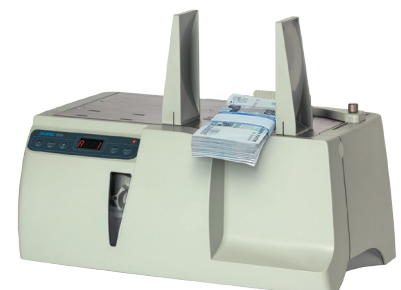
Wide packaging table