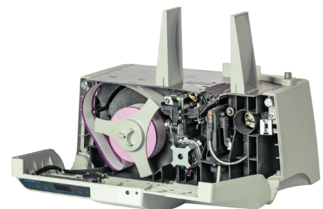
Simple access to the band-moving track