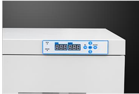
Digital display and control panel